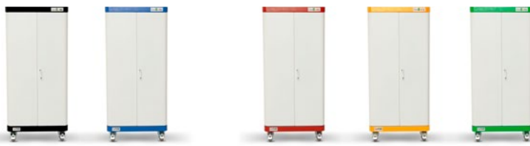
Standard Black & Blue