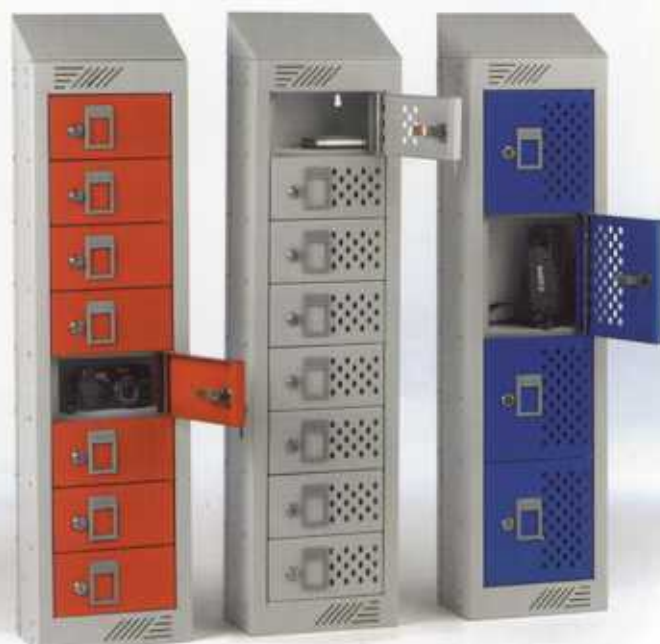
Locker doors can be solid or perforated.